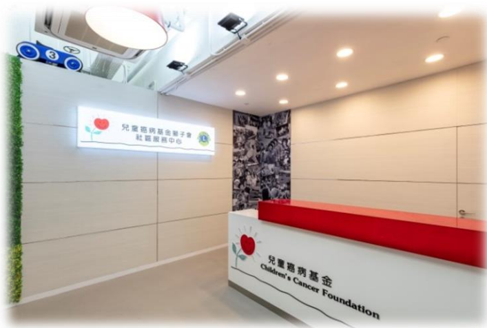
Community Service Centre

Survivors returning to the community still face a lot of challenges. Through our two centres, we provide a series of programmes to help them reintegrate into the community.