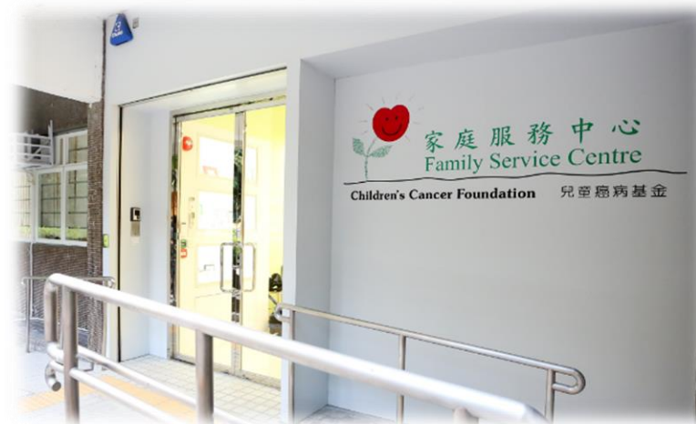
Family Service Centre